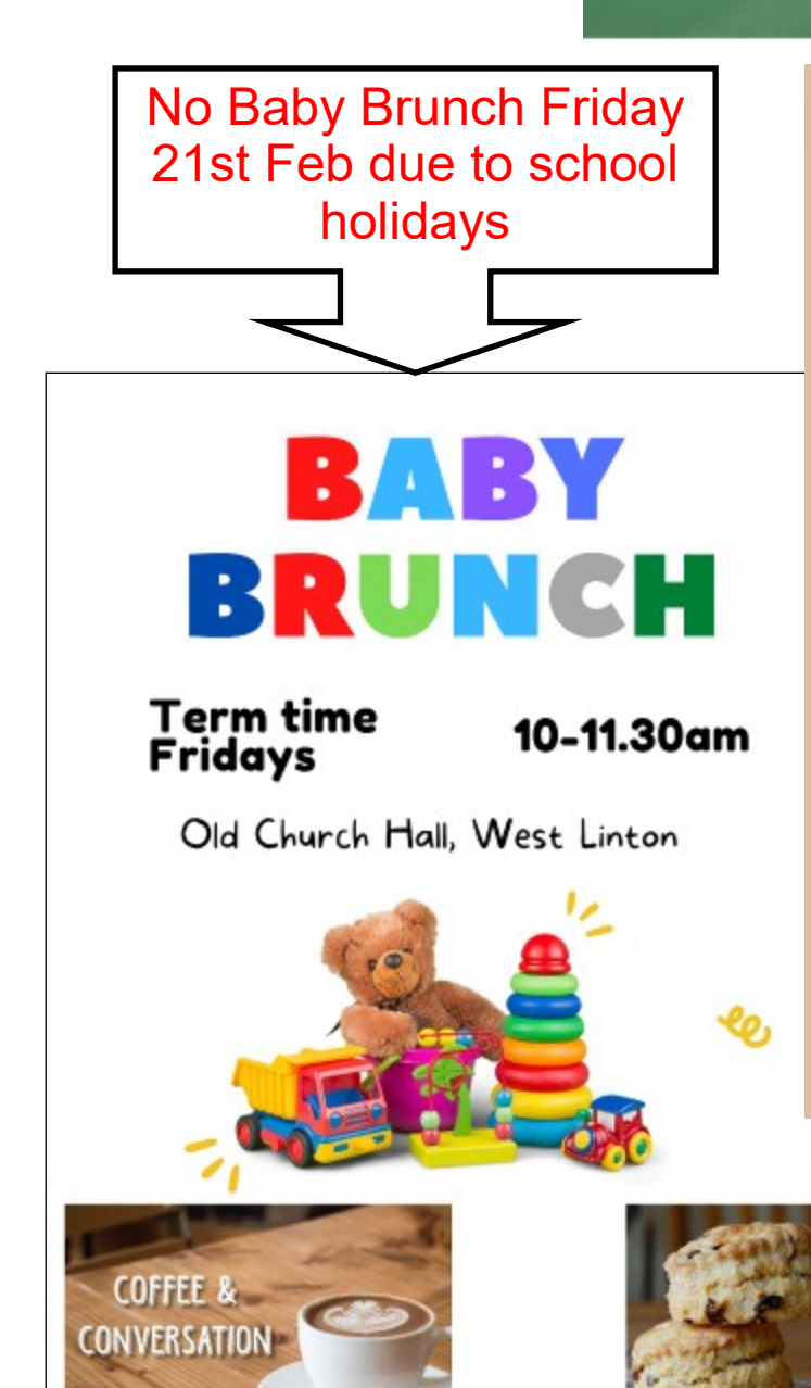
All ages & abilities welcome

Fridays 7 - 8.30pm New Church Hall, West Linton